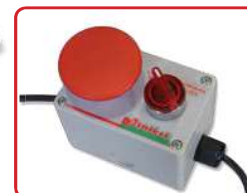
Electro-hydraulic safety control with push button over ride