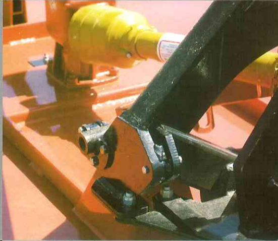
Tool Arm Stand when tractor is unhitched.

Breakaway Linkage to protect equipment from damage if outer corner or cutter contacts an obstruction.