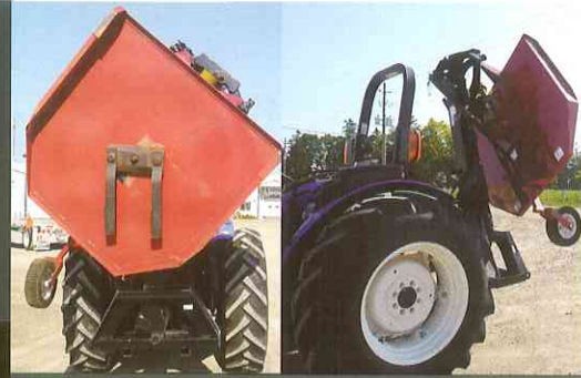
Tool Arm in Transport Position (weight is close to centerline of tractor)

Transport arm in the collapsed position to reduce stress to the arm and also to stabilize the weight.