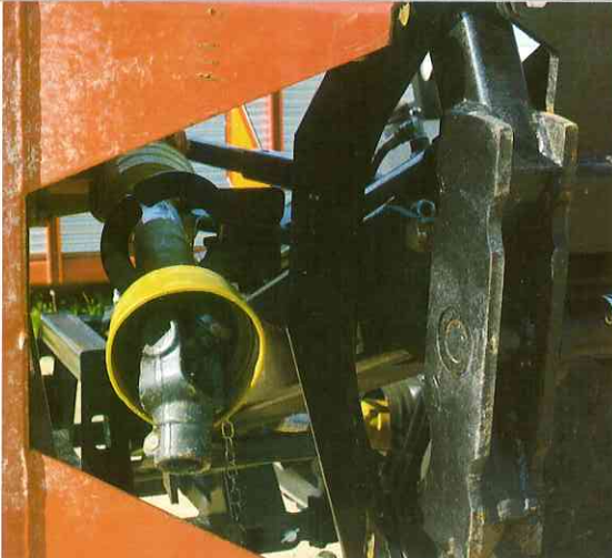
PTO holder used in transport position.