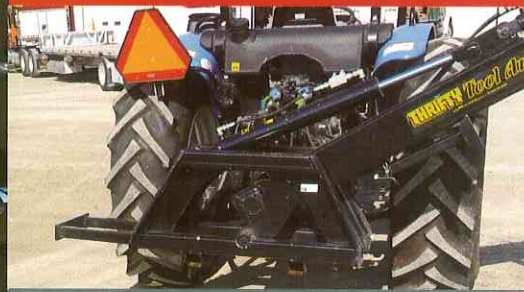
Counterweight Bracket (extended) for suitcase weights add up to 500 lbs of counter weight.