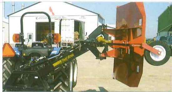
Tool Arm Raised to Transport Folding position