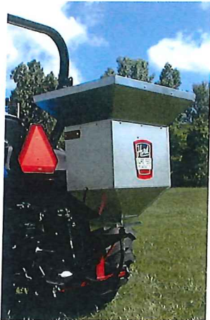
2 bushel extension hopper