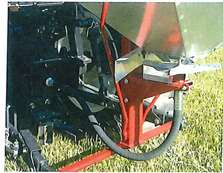
Flexible shaft P.T.O. coupler