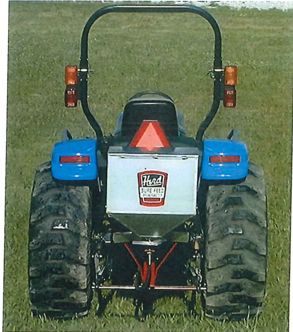
S3B P.T.O. Spreader for Category 1 Tractors

The S3B comes standard with 3-point hitch mounting for category 1 tractors. Brace rods are available for drawbar mounting. The hopper is welded galvanized steel and includes a hinged lid to keep material dry. The frame of the spreader is heavy duty steel that supports the hopper. The S3B utilizes a vibrating rate gate and a spinning agitator for constant material flow. The hopper holds 3 bushels or 200 lbs. of most material. The optional hopper extension holds 2 additional bushels or 150 lbs. Lid available for hopper extension. (DO NOT MOUNT THIS SPREADER TO A LAWN TRACTOR, GARDEN TRACTOR OR ALL TERRAIN VEHICLE (ATV) DUE TO SIZE OF SEEDER.