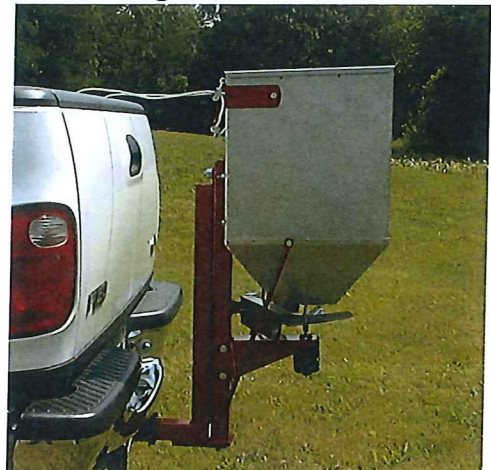
2" Receiver Hitch Mount (T700)