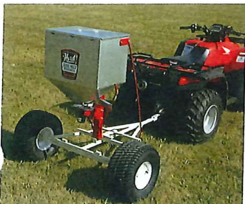
M3B on T12-300 Flotation Trailer