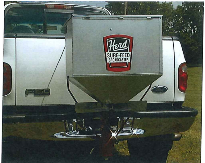
M3B Electric Seeder

This versatile spreader is designed to be mounted to farm tractors, pickup trucks, turf trucks, (such as the Cushman Truckster) or our T12-300 flotation trailer. (DO NOT ATTEMPT TO MOUNT THIS SEEDER DIRECTLY ONTO A LAWN TRACTOR, GARDEN TRACTOR OR ALL TERRAIN VEHICLE (ATV).) The spreading width can be controlled from 10 feet to 30 feet (with optional rheostat). Amounts of material being spread can be accurately controlled with the maximum spread width depending upon the density of the material being spread. The M3B is powered by a heavy duty 12 volt D.C. electric motor. Wiring kit with switch is included. This unit is shipped with brace rods for universal mounting.