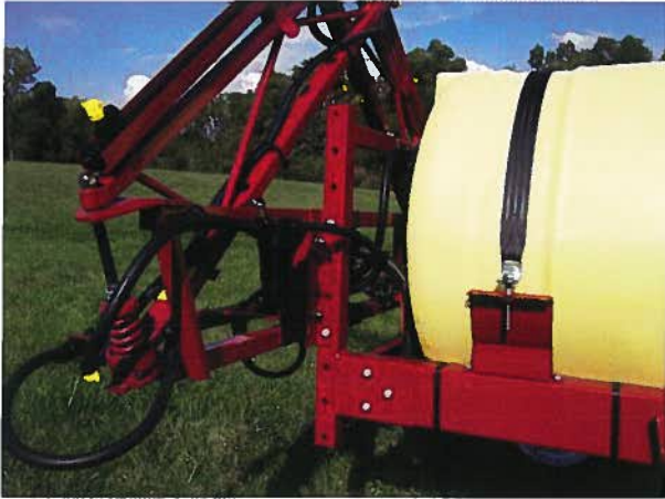
Boom height can be adjusted from 20"-40" for a variety of crop conditions.