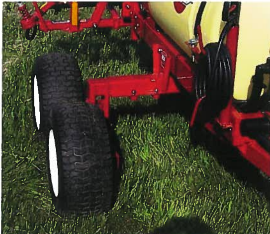
The optional tandem axle and 23 X 10.5 – 12 tires allow for a smooth ride in rough field conditions. Adjustable from 40"-80" width. ( Walking axle must be reversed for 40" track width)